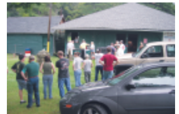
On August 24th, Lewis Lumber Products held their LLP Employee Appreciation Day.