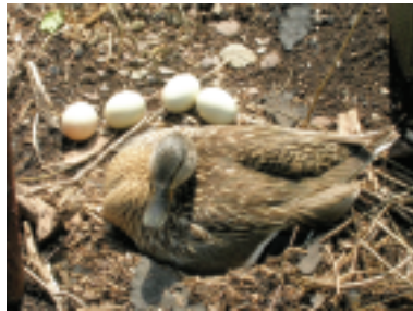
This content mallard duck decided to lay some eggs underneath our Dust Collection Pipe.